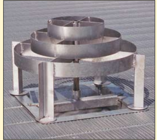
Discharge Guard for On-Farm Grain Bins

Cuts or breaks up chunks of grain threatening to block discharge well. Allows grain to flow around chunks of grain that will not break up, moving chunks away from well opening.