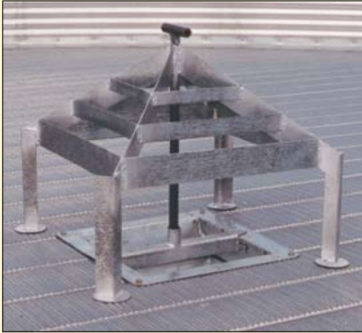
Discharge Guard for Commercial and Stiffened On-Farm Grain Bins